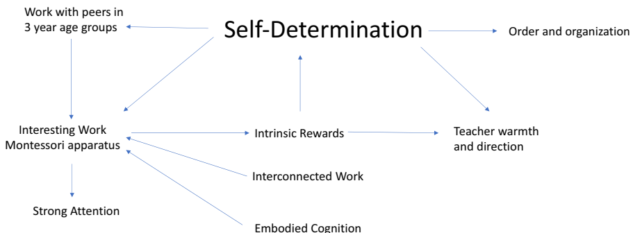
Fig. 2 Some evidence-based elements of the Montessori system

In Montessori classrooms, “children have free choice all day long. Life is based on choice, so they learn to make their own decisions. They must decide and choose for themselves all the time ... They cannot learn through obedience to the commands of another” (Montessori 1989, p. 26). Montessori gained this insight from a simple incident in the first classroom in Rome (Montessori 1962/1967). The teacher had arrived late, to find that the children had asked the janitor to let them into school. At the time, the Montessori materials were kept locked in a cabinet until distributed to children by the teacher. Yet on that day, the children had taken the materials out themselves and were using them when the teacher arrived. Montessori was