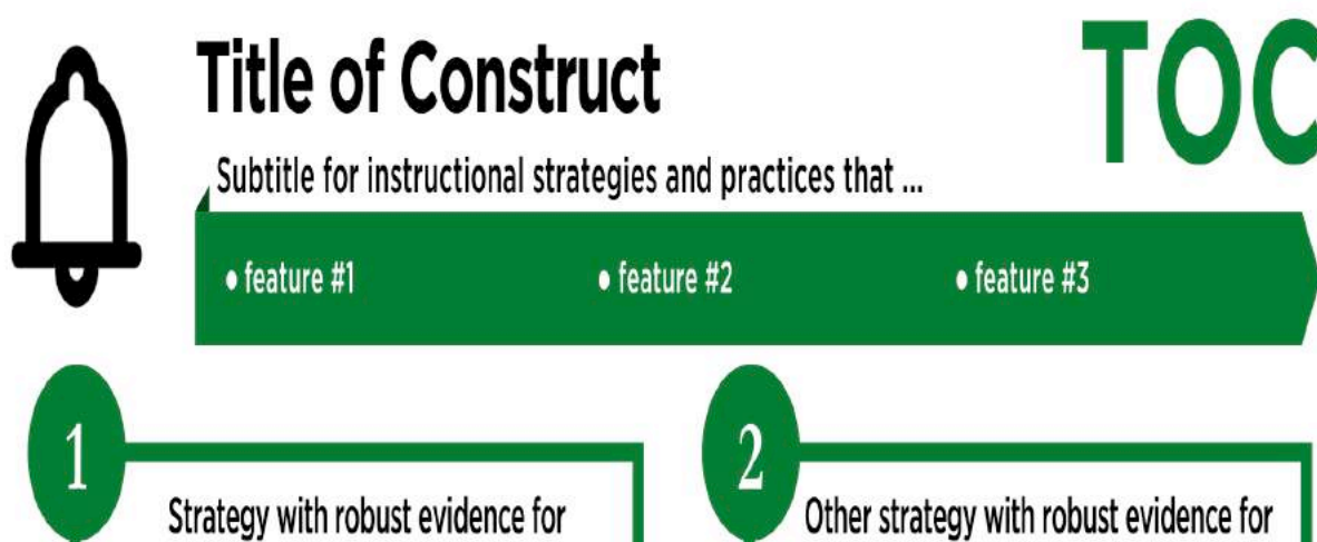
Figure 1. Design Template for the EAC-SOS Guide, with features, strategies, routines, and tools.