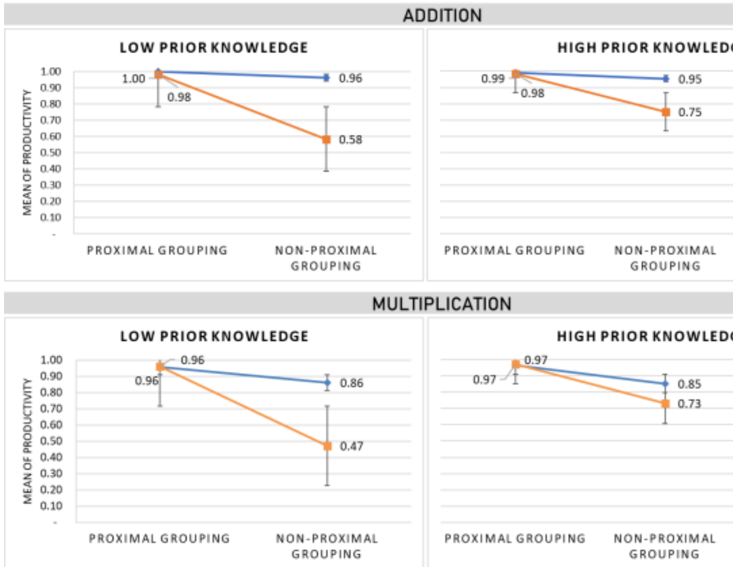
Figure 3. Interaction Plots for Productivity of First Steps (Note that students were divided into two groups by a mean-split of the prior knowledge score ( M=7 ))