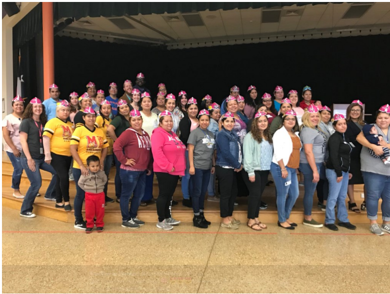
Photograph of parents and staff wearing paper models of the brain they assembled at the March 2018 SEL parent camp.