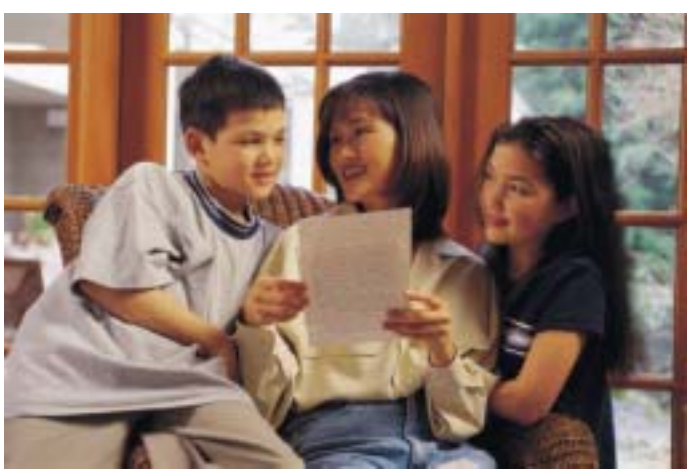
Austin Independent School District Department of Program Evaluation 2004