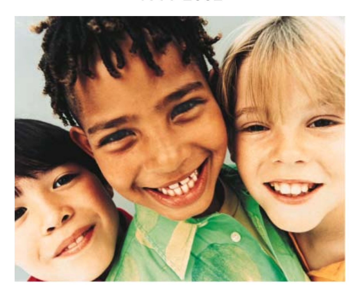
Austin Independent School District Office of Program Evaluation