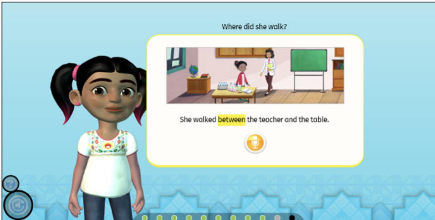
Figure 1. Example program image

The program is grounded in various theories of second language acquisition. Comprehensible input (Krashen, 1982) is presented via language frames, and an auto-placement tool places users at an appropriately challenging level. A speech recognition engine attuned to various English accents allows for users to practice speaking (Output Hypothesis; Swain, 1995), while corrective feedback is provided explicitly to learners (Interaction Hypothesis; Long, 1996). Furthermore, an adaptive program design provides students with explicit instruction and additional practice for activities they answer wrong twice in a row.