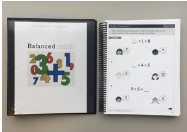
(b) Active control materials