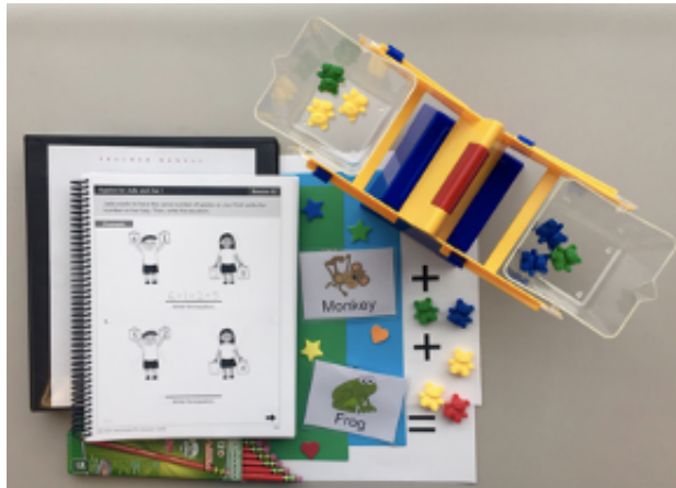
(a) ICUE intervention materials