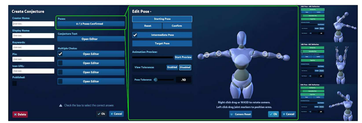
Figure 1. The THV Conjecture Editor and THV Pose Editor (for creating directed actions) with an example of a directed action sequence (far right).

The THV Conjecture Editor enables students to create new movement-based game content. Students add new conjectures and then design mathematically relevant directed actions by manipulating the sequences of poses of the avatar (Figure 1). Using the Pose Editor, student groups collaboratively generate 2-3 poses (starting, intermediate, and target pose; see middle panel of Figure 1) to create directed actions for each conjecture. Once poses have been designed, players can preview the movements as an animation. Once completed, user-generated actions are stored in the online database of THV and accessible to any other users to access and play.