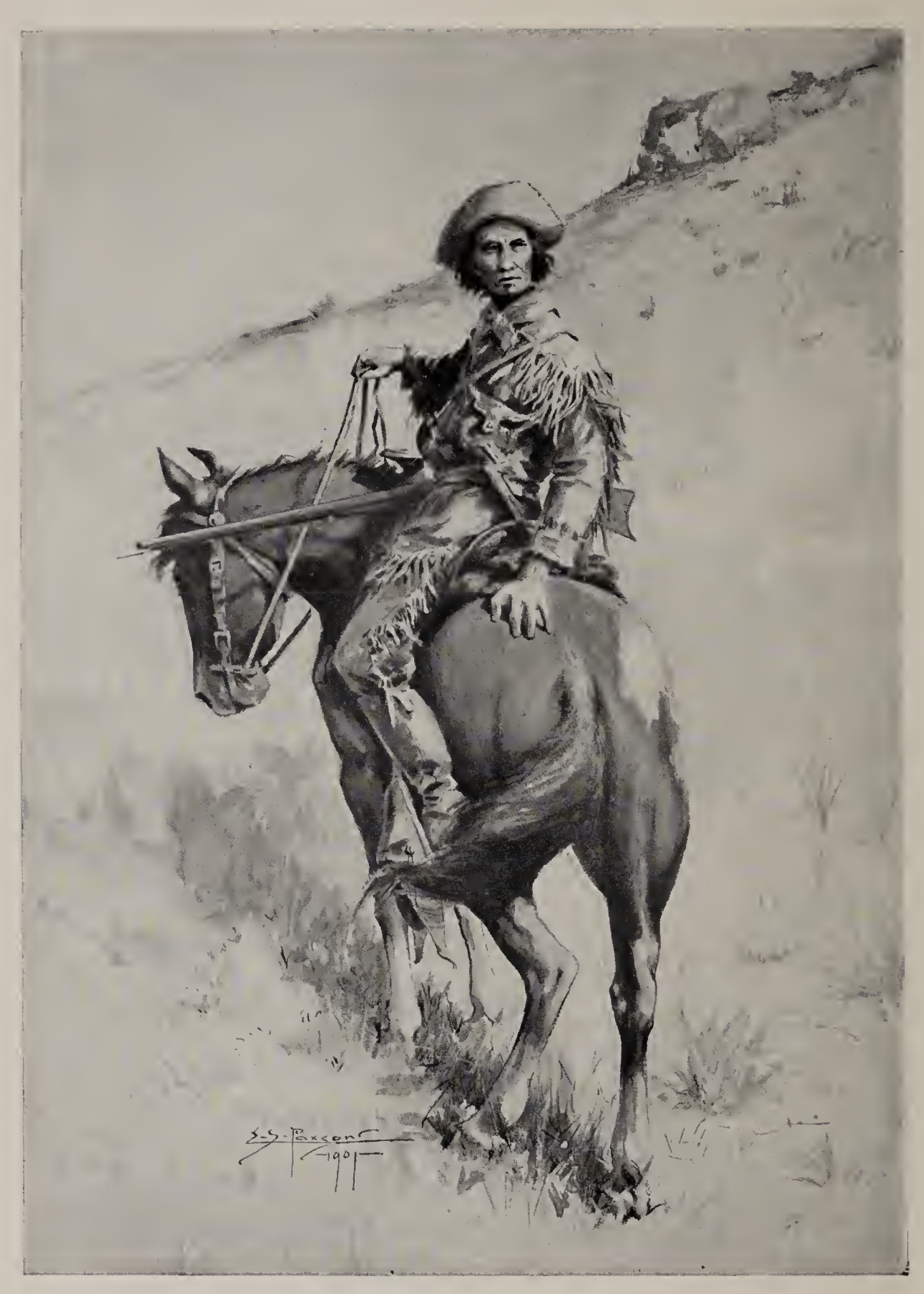
An Old-Time Frontier Scout. (From a drawing by Paxson.)