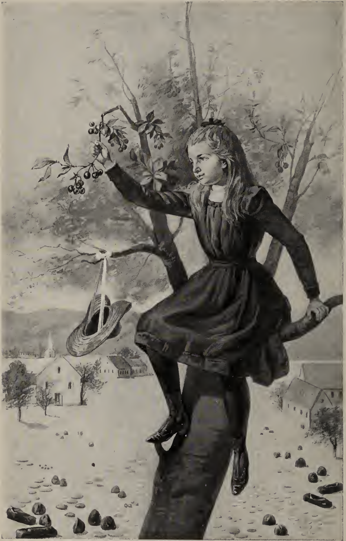
“Lily rocked and ate till she finished the top of the little tree” Frontispiece.