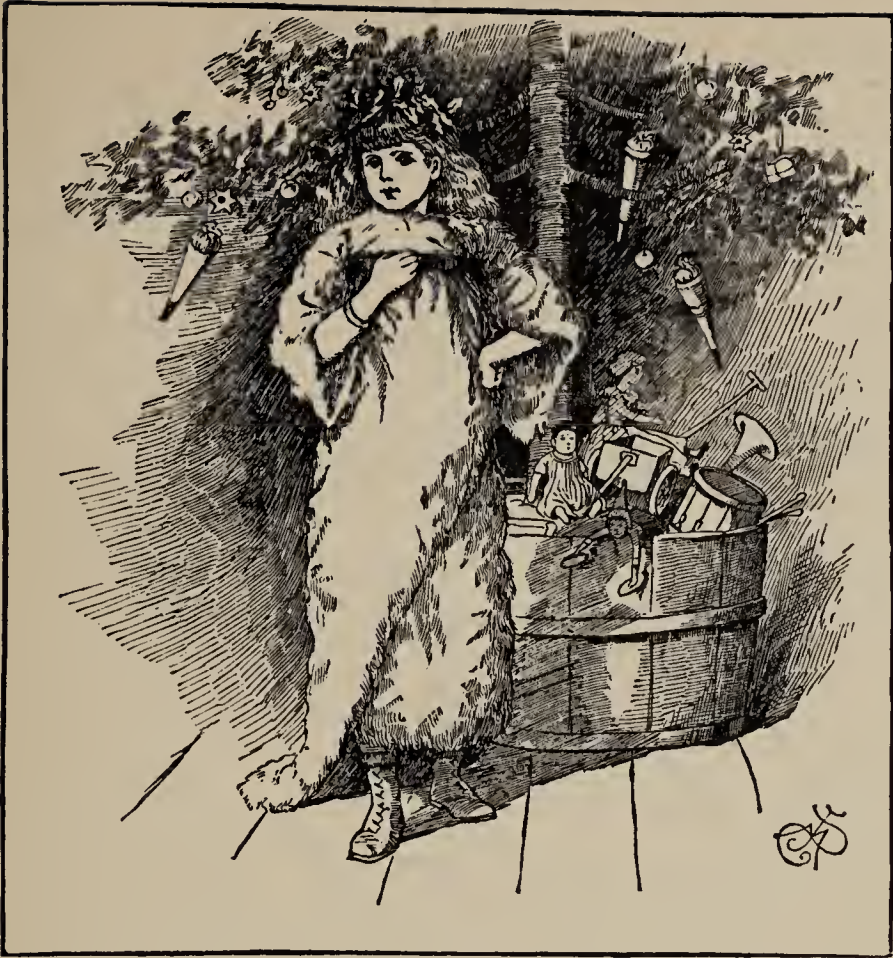
She actually stood in "a grove of Christmas trees." — PAGE 30.