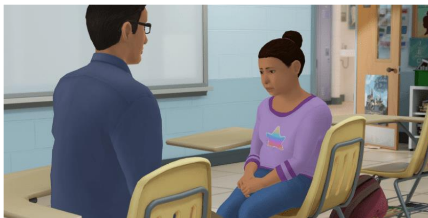
Figure 1. Screenshot from Resilient Together: Coping with Loss at School program.