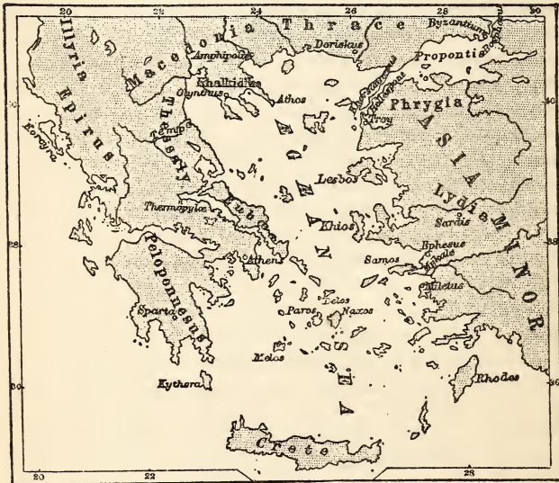
GREECE AND THE ÆGEAN COASTS.

purple dye for hangings and for great men's robes from the shell of a little sea-creature, and how to dig mines and to work metals (2 Chronicles iii. 3, 7 ; Esther viii. 15). When the best trees in the forests of Mount Lebanon were cut down, and the Phœnicians had to go in search of wood for their ships, they found abundance of oak, pine, and beech on the shores of the Ægean Sea. They discovered that the root of the Greek evergreen oak could be used for tanning,