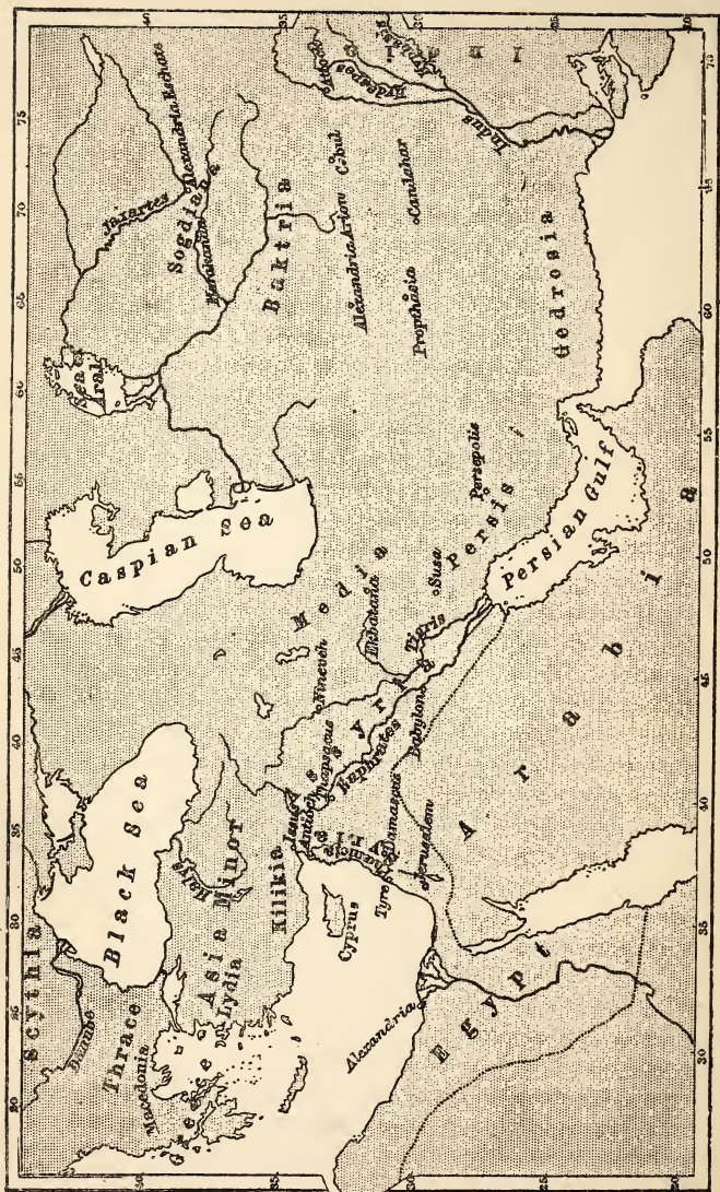
PERSIAN EMPIRE AND GREECE.