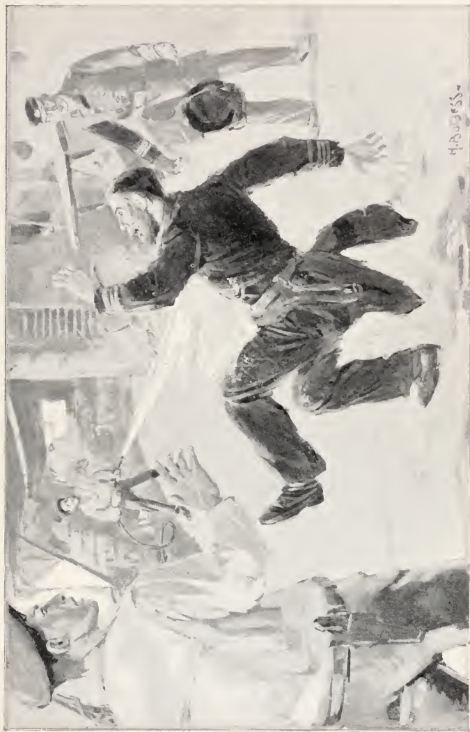
"THE STREAM STRUCK THE COMMANDER WITH FORCE." Page 331.