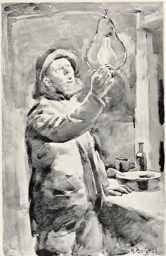
“DOWSE THAT GLIM IN YOUR FO’CASTLE.” Page III.