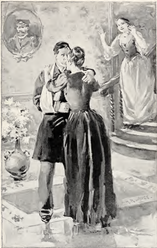
“MRS. PASSFORD RUSHED DOWN THE STEPS.” Page 264.