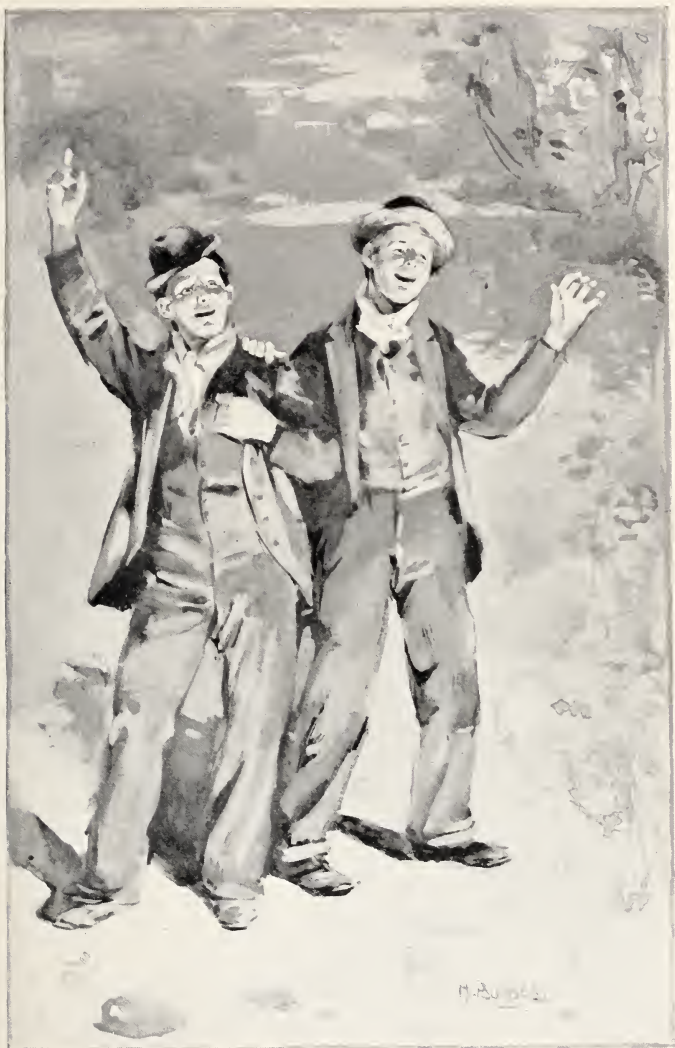
“THE TWO COUNTERFEIT REVELLERS.” Page 48.