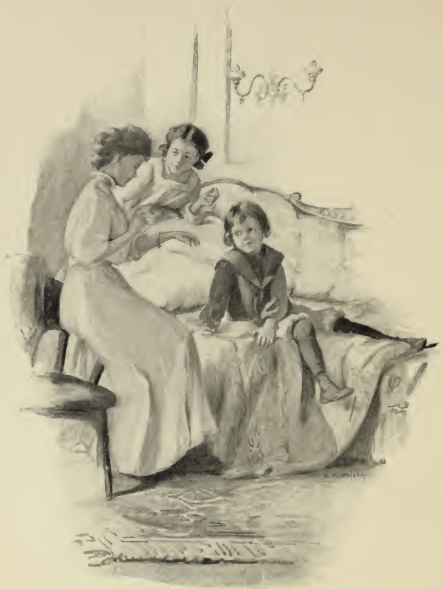
THE WEDDING PRESENTS