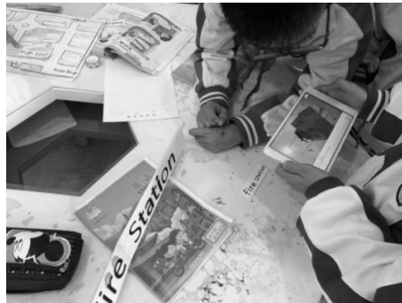
Figure 3. Cooperating in groups

Students of two parallel classes in the 4th Grade took part in this study, 35 of them divided into the experimental group and 32 into the control group. The experimental group cooperated to learn with handwriting recognition AR application as shown in Figure 3, while the control group learning by analyzing the materials and discussing with the group instead.