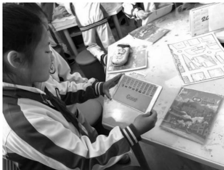
Figure 2. Matching buildings and descriptions

In this feature, students were asked to match the specific building with the description of each of them. For instance, the students should pair the description: "You can go here to buy medicine and you can also buy some food and drinks here." with the model of drugstore. In this part, students were asked to pair all the nine buildings with their description by dragging the models to the correct place.