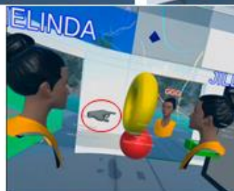
Figure 2. Melinda and Jill exploring Task 6 in Table 1

(Melinda indicating the missing part of the donut with index finger)