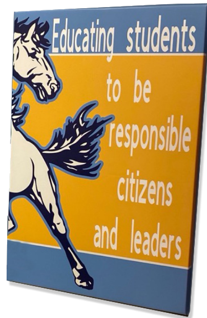
Richland #44 School District's vision statement