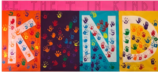
A poster created by Richland #44 Elementary School students