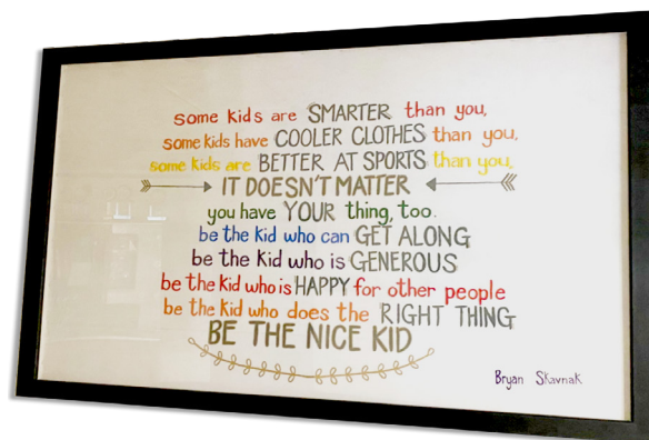
As reflected in its hallway décor, Wilton celebrates students’ individual strengths and emphasizes the importance of social and emotional skills.

The adoption of MTSS included helping some staff shift the ways in which they view student performance and, as Jordan says, “get to the root of the problem.” Consequently, whether a student appears to be struggling with academic concepts, motivation, behavior, or attendance, Wilton’s staff think about what they can do to support the student in overcoming those barriers, rather than lowering expectations or jumping to disciplinary consequences.