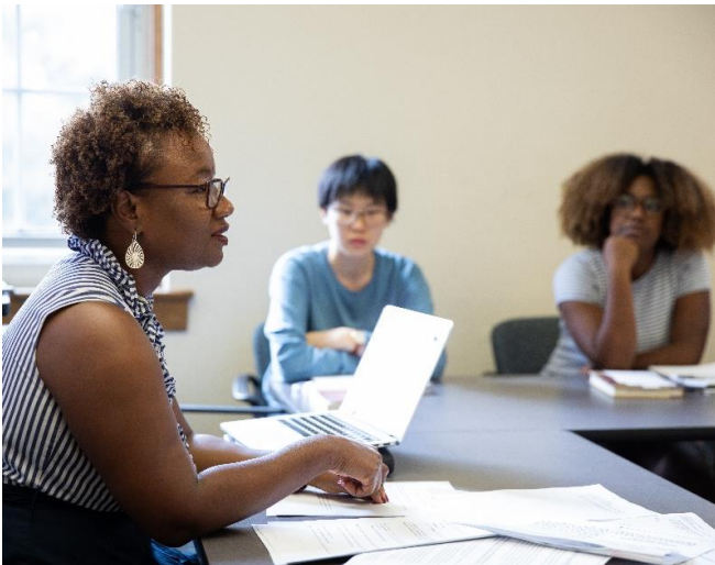
College of the Holy Cross

U.S. percentages are from the 2020 U.S. Bureau of Labor Statistics Occupational Employment Statistics and are based on faculty at U.S. postsecondary institutions that award bachelor's degrees.