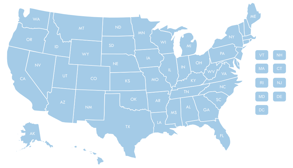
Visit the Micro-credential Policy Map

Currently, the COVID-19 pandemic has created a need for flexible and relevant online professional learning. Micro-credentials help educators demonstrate their proficiency in rigorous, research-based content and receive recognition for their skills in an online environment. This flexibility is essential as educators and their students navigate unpredictable schedules, learning models, and health concerns. With the COVID-19 pandemic, many schools are transitioning to hybrid or fully remote learning models for students which can