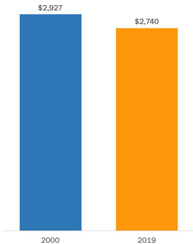
Per-Student Baseline State Funding for CUNY Community Colleges Has Stagnated