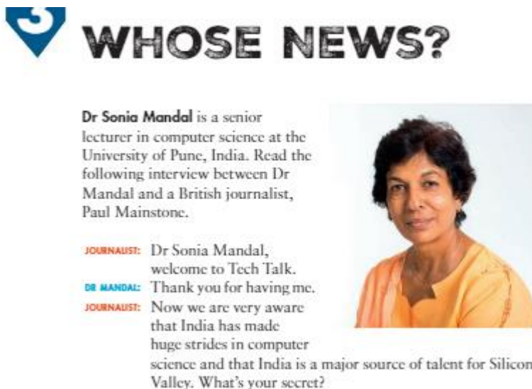
Figure 1. Successful bilinguals (p. 90)

The textbook provides various sociolinguistic contexts including focus on characters from outer circle countries. The unit called “News” deals with various aspects of news, and it presents a four-page interview of a Computer Scientist from the University of Pune, India by a British Journalist. Although the text does not include any other language except English, it makes it inclusive in terms of gender, inclusivity of the Global South and outer circle English speakers where the underlying implication is that the speaker is a successful bilingual.