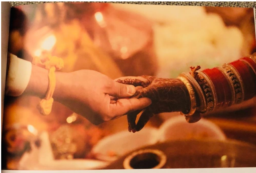
Figure 2. Indian culture

Linguistic ecology simply means the sum of all languages in a country. Sweden is a small multilingual and multicultural country with many people born outside of Sweden, and 20% of students at the compulsory school level are from an immigrant background (Lundahl, 2014). With many languages spoken in Sweden, this ecology of languages or backgrounds or a clear local context is missing in the texts and pictures/photos of the book. However, there are various examples from the textbook where people both from minority and majority backgrounds are presented in the units, but some of them do not make any reference to Sweden or any of its cities. For example, “The light of my life” is a section of a unit where two characters Megan White & Reyansh are two scientists in the USA, whereas Reyansh is a British Indian. In the text there is a reference to his accent as well as the problems in arranged marriages.