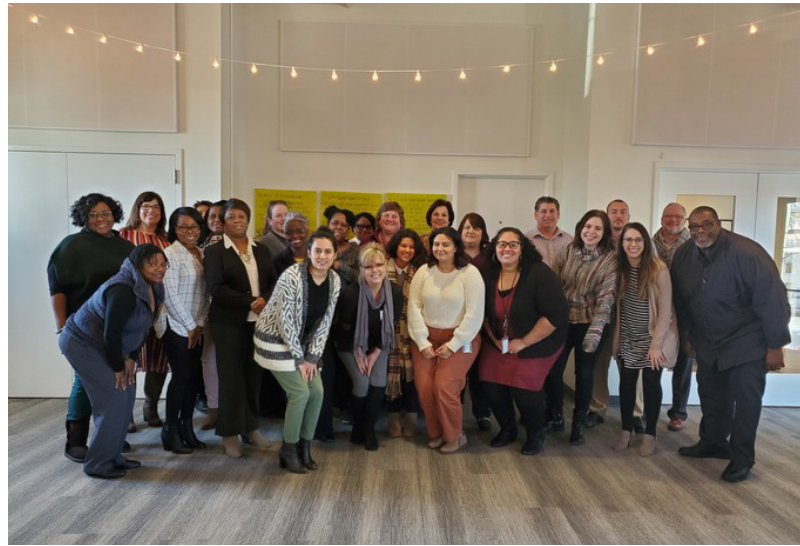
Employees from local companies and government agencies participated in another successful Reconnect Ambassador training at the Thistle Farms Nashville Training Center in 2019. Reconnect Ambassadors provide encouragement and support to adults in their communities interested in

We also partner with public school systems and community colleges for recruiting. I'm conducting Reconnect Ambassador trainings at Nashville State Community College because we know that returning students are underutilizing the resources available to them. For instance, although we were assisting nearly 400 enrolled students at Nashville State Community College, we learned almost 90% of students eligible for