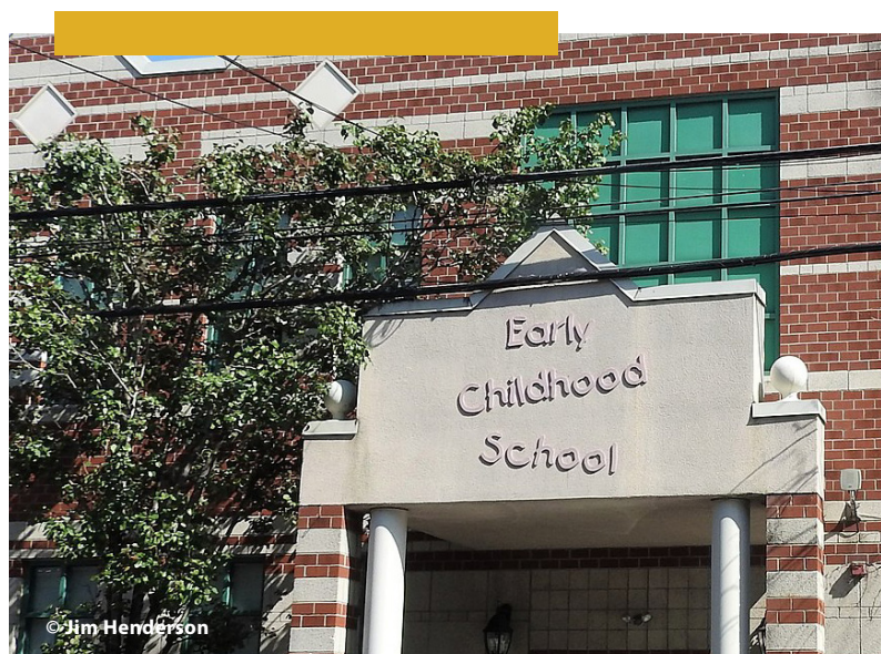
Abbott Preschool: West New York, NJ.

Today, the Abbott Preschool Program, with its genesis in the Abbott litigation, serves nearly 50,000 youngsters and is a national model for the delivery of effective early education for children in high-poverty, racially isolated communities.