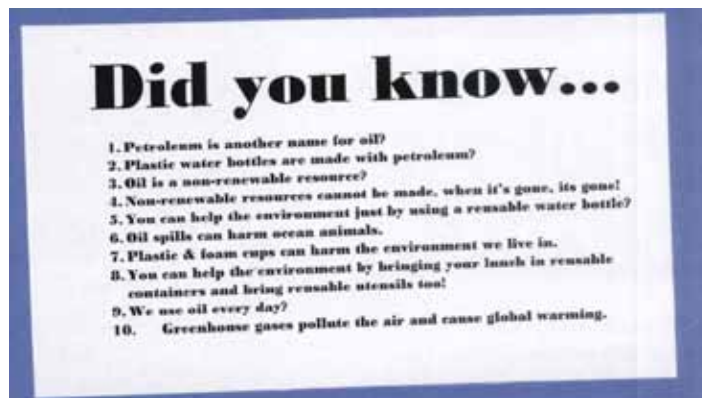
Figure 1. Poster to Educate Others About Plastic Use

There are many other science concepts from NGSS that can be addressed through environmental service-learning. For example, LS4.D is about biodiversity and humans, and focuses on the central questions: What is biodiversity, how do humans affect it, and how does it affect humans? Environmental service-learning can be used to address College, Career and Civic Life (C3) standards from dimension 4, taking informed action such as D4.7 (grades 3-5): Explain different strategies and approaches students and others could take in working alone and together to address local, regional, and global problems, and predict some possible results of their actions (National Council for the Social Studies, 2013). Language arts and mathematics standards can also be taught and applied within a service-learning unit.