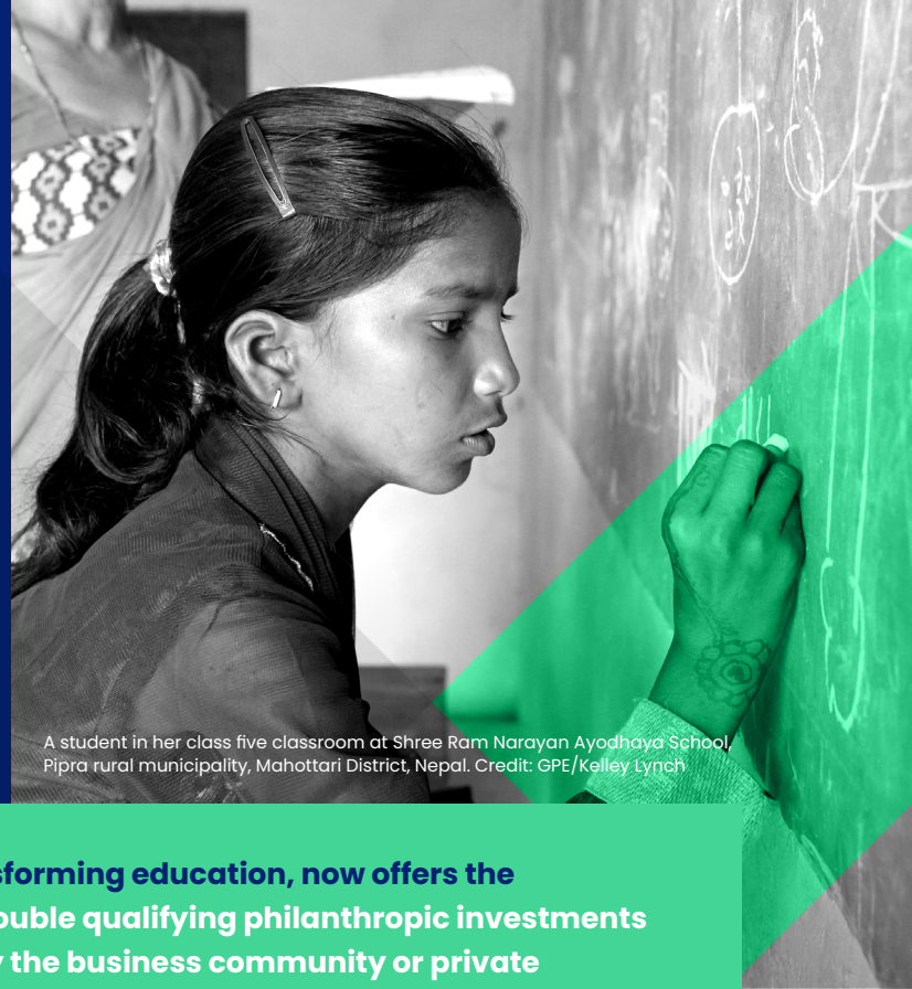
A student in her class five classroom at Shree Ram Narayan Ayodhya School, Pipra rural municipality, Mahottari District, Nepal.

A 1:1 Match for Investments in Education in the World's Poorest Countries