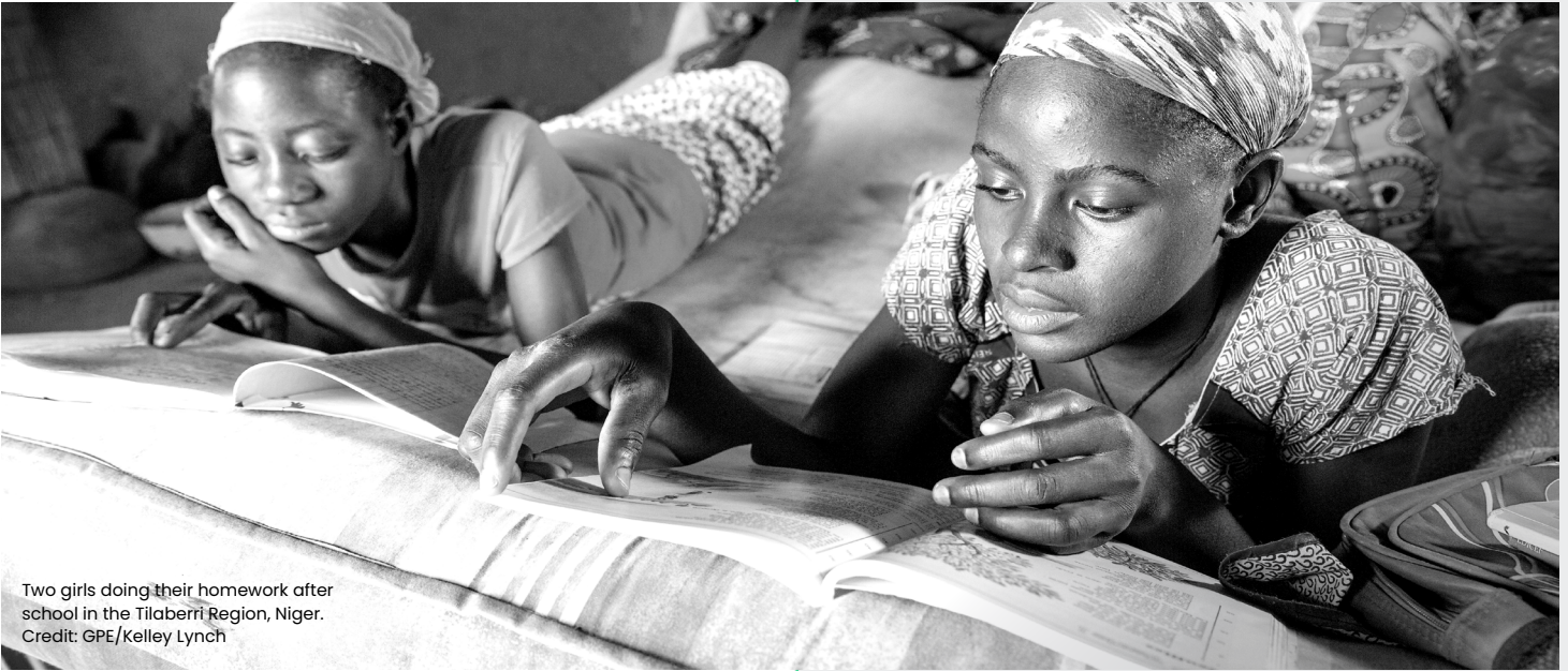
Two girls doing their homework after school in the Tilaberrri Region, Niger.