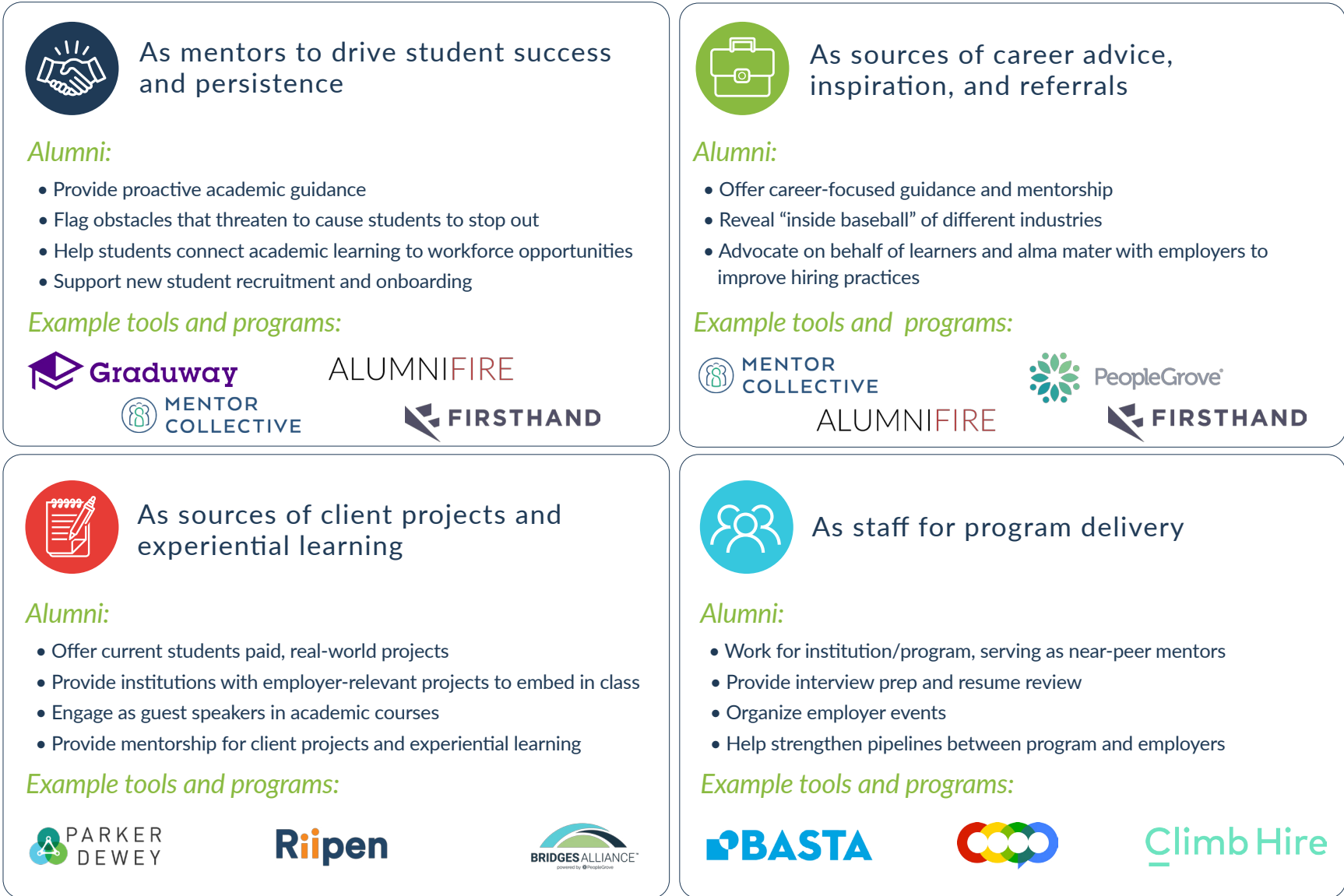
Figure 1. Four valuable roles alumni can play

Note: Many of these tools operate as infrastructure tools, serving multiple functions and stakeholders beyond alumni engagement.