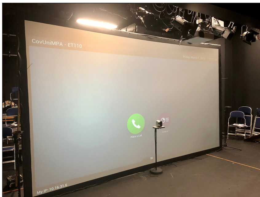
Figure 1. Set up of screen with camera slightly above waist height 7

Adobe Connect was also used to give each scene group (consisting of two Tampere and three Coventry students) their own individual ‘rooms’ to work independently on their scenes. Facebook was also utilised for scheduling details, sharing research materials, and to provide a quick way for students in each location to share photographic and video material of the ongoing work.