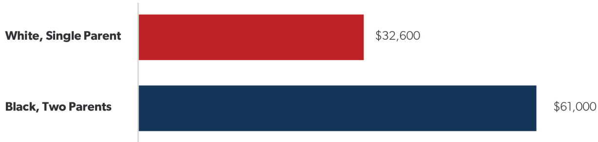
Figure 1. Median Net Worth of Two-Parent Black Households vs. Single-Parent White Households with Children

Note: Households headed by a widowed parent were excluded from analyses.