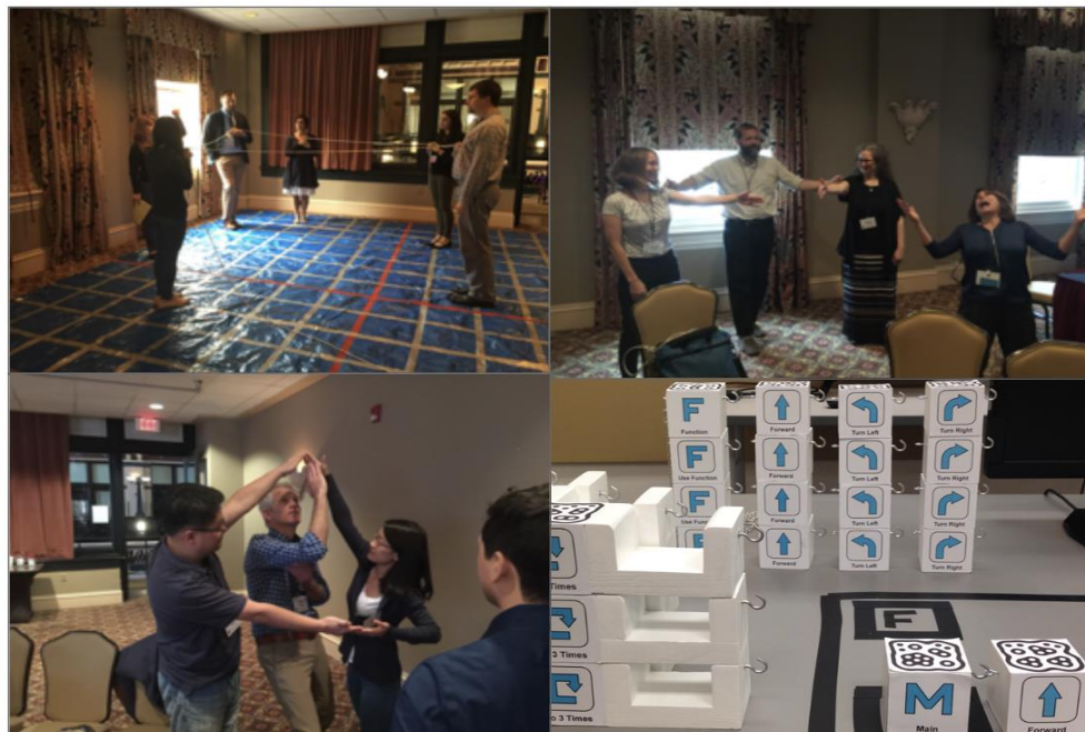
Figure 2: A Small Selection of Embodied Activities Created by EMIC Organizers and Experienced by EMIC Participants