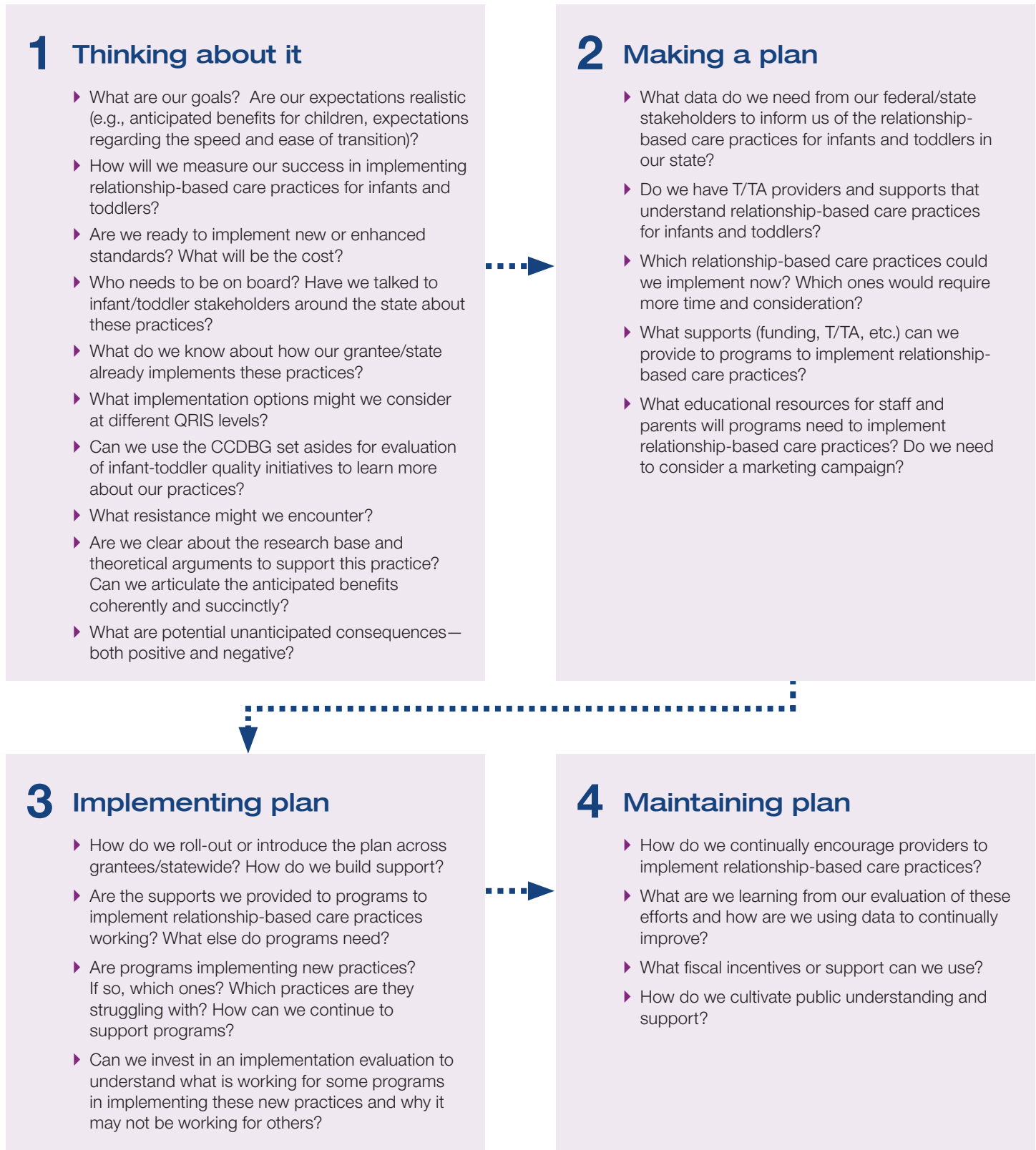
Figure 2. EHS Grantee/State/QRIS Decision Points: Is my grantee/state ready to incorporate relationship-based care practices?