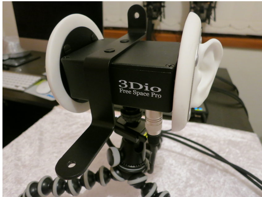
Fig. 2. 3Dio's Free Space© device.

The method of recording binaural sound uses two microphones in a mock head with two ear-shaped pinnae, simulating the ear's natural position, creating an ear spacing or "head shadow" from the head to the ears. In fact, the student perceives Interaural Time Differences (ITDs) and Interaural Level Differences (ILDs). Adjustments (known as Head-Related Transfer Functions (HRTFs) are done automatically by the system itself. That means that sound is sequenced naturally as sound “involves” the human head and is adapted to the form of the outer and inner ear. The most often used commercial device is 3Dio Space Pro© developed 3Dio Company.