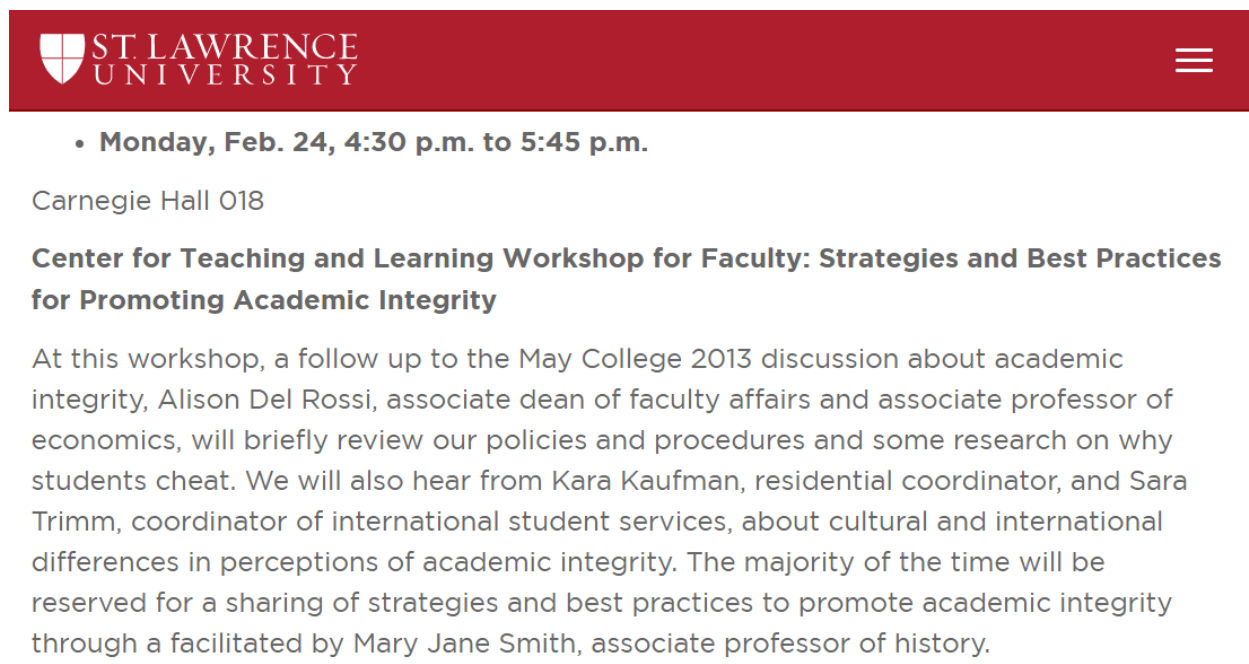
Figure 2. Description of St. Lawrence University Academic Integrity Week Programming

Screenshot taken May 3, 2020 (Integrity Week, 2014).