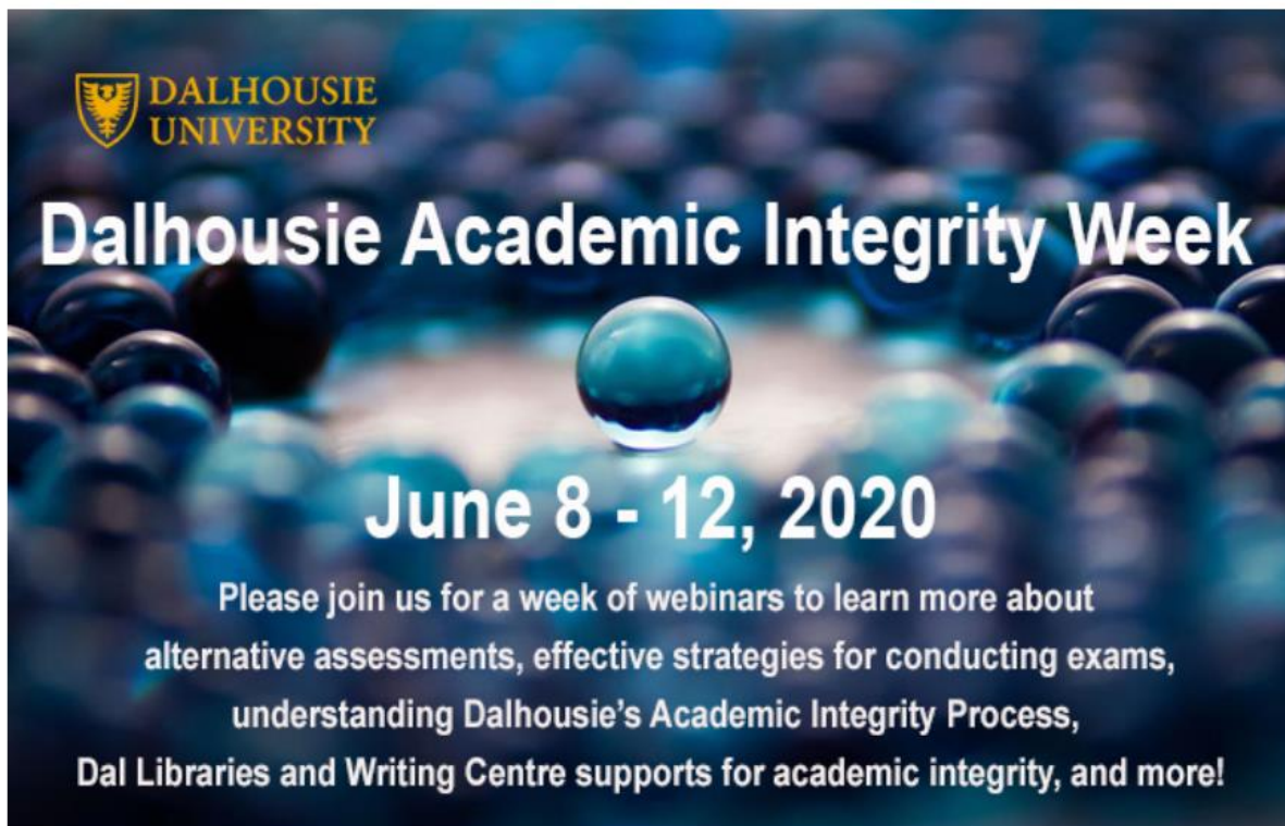
Figure 4. Description of Dalhousie University Academic Integrity Week Programming

As we make the move to online teaching, we need to ensure the continued academic integrity of our students' learning. What approaches can we take, and what considerations do we need to make, to encourage and support students' honest engagement in the assessment process?