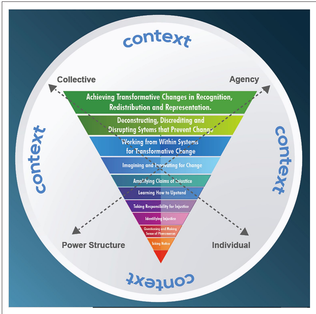
Figure 1. The Upstanding for Justice Heuristic.

cultivation of individual capabilities that the community supports (e.g. Sen and Nussbaum), or the absence of unjust oppression (e.g. Young).