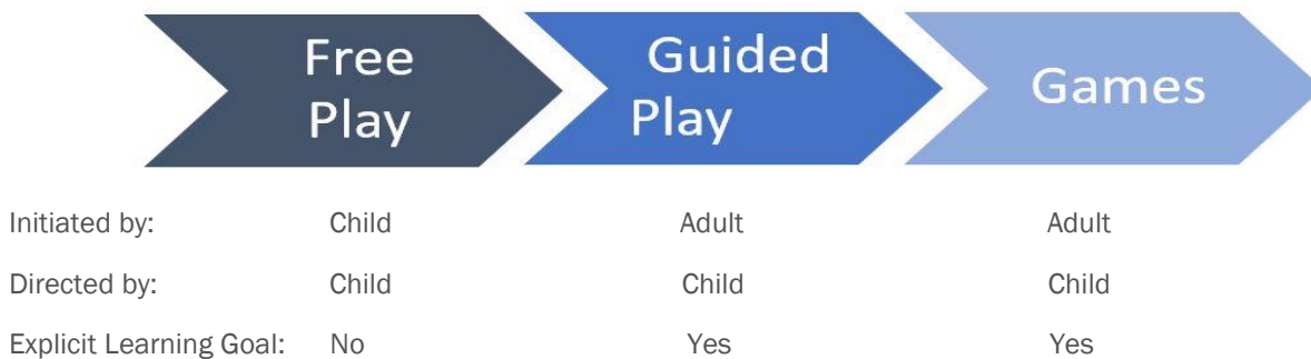
Table 1: Play as a Spectrum