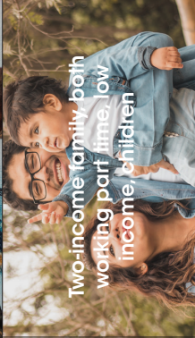
Two-income family, both working part-time, low income children