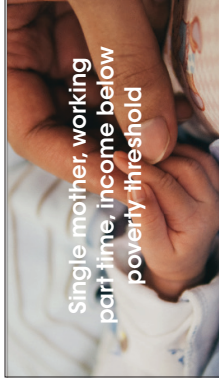
Single mother, working part-time, income below poverty threshold

Current or Future Policy Priority (high, moderate, low)