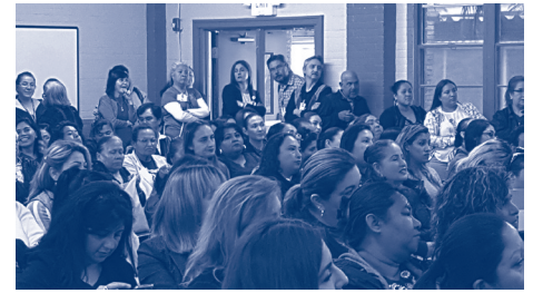
Some Education CAFEs hold yearly community events, called Mesas Comunitarias , to highlight their projects to benefit education in their schools.

Other Education CAFEs brought families together to examine new education policies and their implications for access to advanced placement, dual credit and pre-algebra courses. (cont. on Page 4)