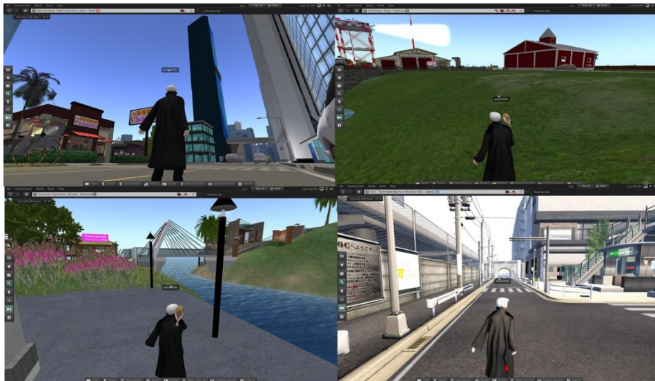
Figure 2. Environment of Second life as appearing in certain locations recreated by the platform