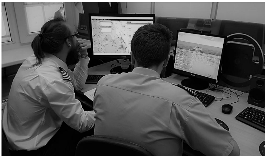
Figure 2. Respondents are testing the "BalticWeb" platform

During the first stage of the work, respondents were divided up into navigational stimulator booths and using laptops, 50 minutes were considered for all the functions offered in the "BalticWeb" platform and subsequently according to the evaluation criteria, evaluation of the offered functions and full analysis of the platform. The author did not introduce respondents to the alternative e-navigation platform interface, so that it would be possible to evaluate the complexity of the platform (see Figure 2).