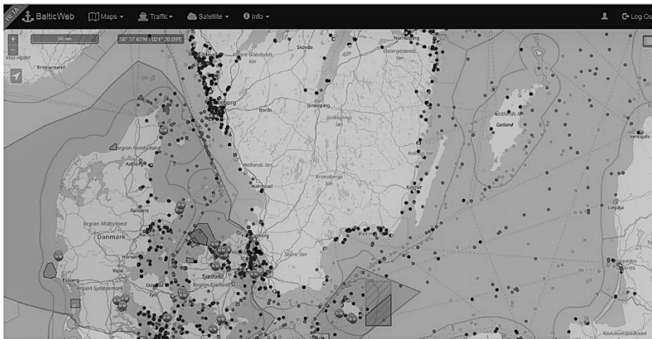
Figure 1. "BalticWeb"