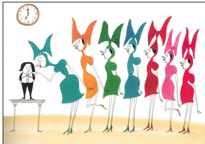
Figure 1: Page 4 of the book Feodoor has seven sisters 1

For each book a reading guideline was developed that explains how to read the book. In general, the reading guidelines requested the teachers to maintain a reserved attitude and not to take each aspect of the story as a starting point for a class discussion, since lengthy or frequent intermissions could break the flow of being in the story and consequently diminish the book's own power to contribute to the mathematical development of the children. To promote the children's mathematical thinking the teachers were suggested to show behavior such as (1) asking oneself a question out loud about the mathematics, (2) playing dumb, or (3) just showing an inquiring expression at a certain page of a book.