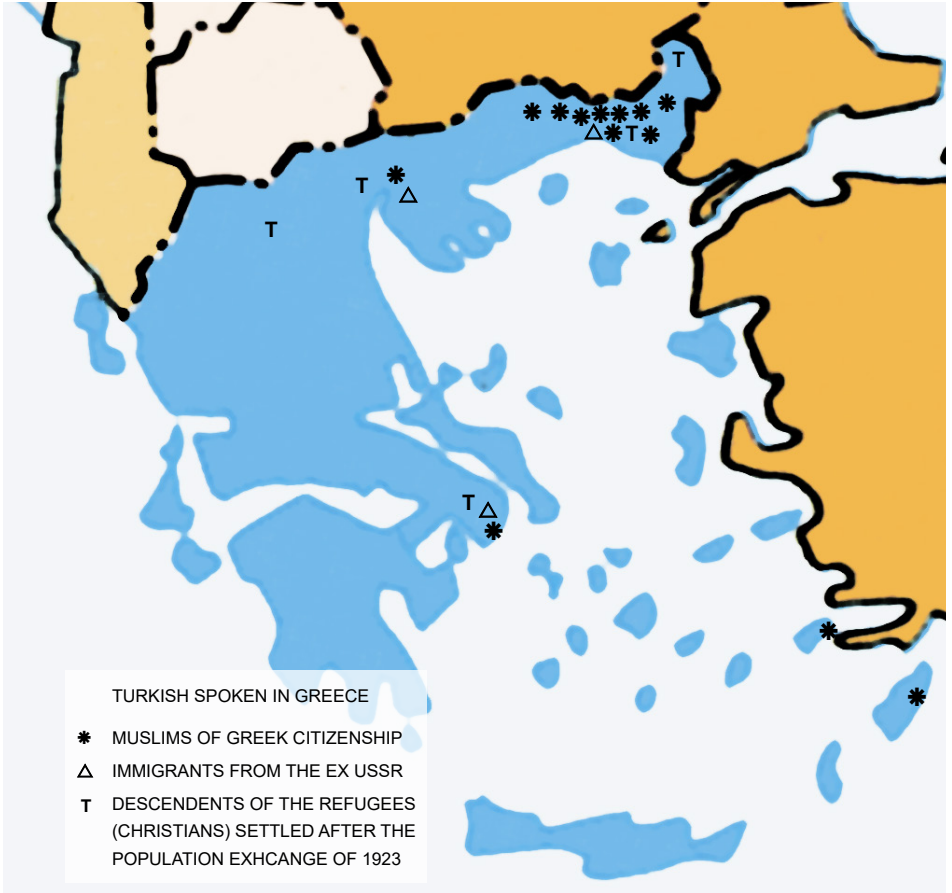
Figure 1. Turkish spoken in Greece.