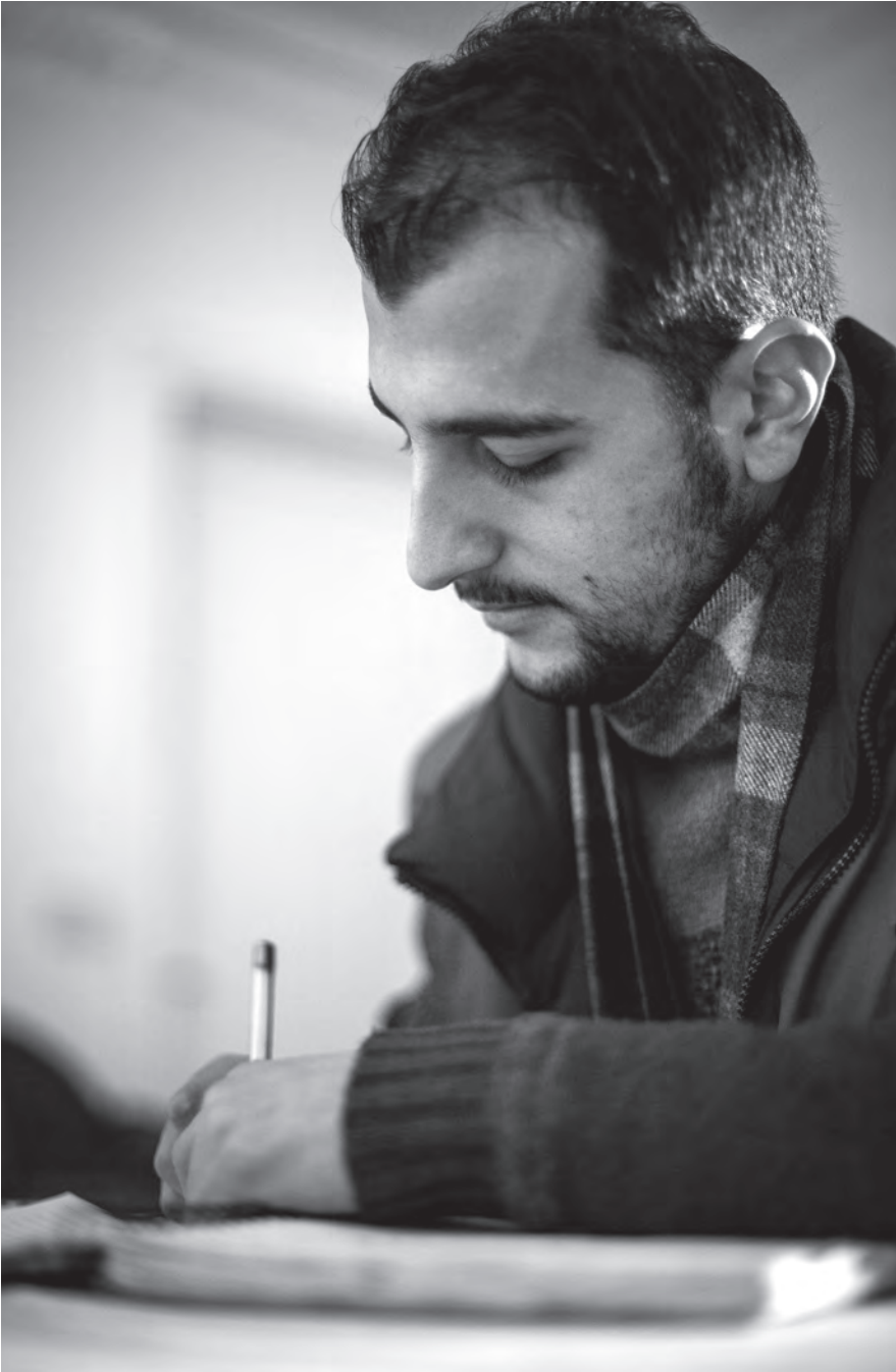
A Syrian refugee student studies at home in the Jordanian town of Irbid.