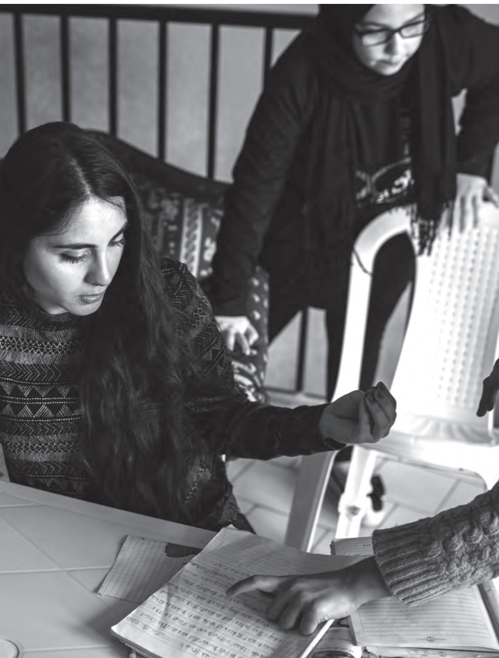
Homework club for Syrian schoolchildren in a makeshift school in the coastal city of Saida, Lebanon.