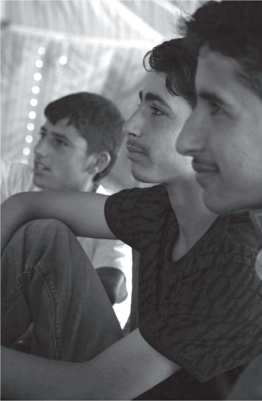
Syrian refugee students taking part in a course in the Zaatari refugee camp in Northern Jordan.