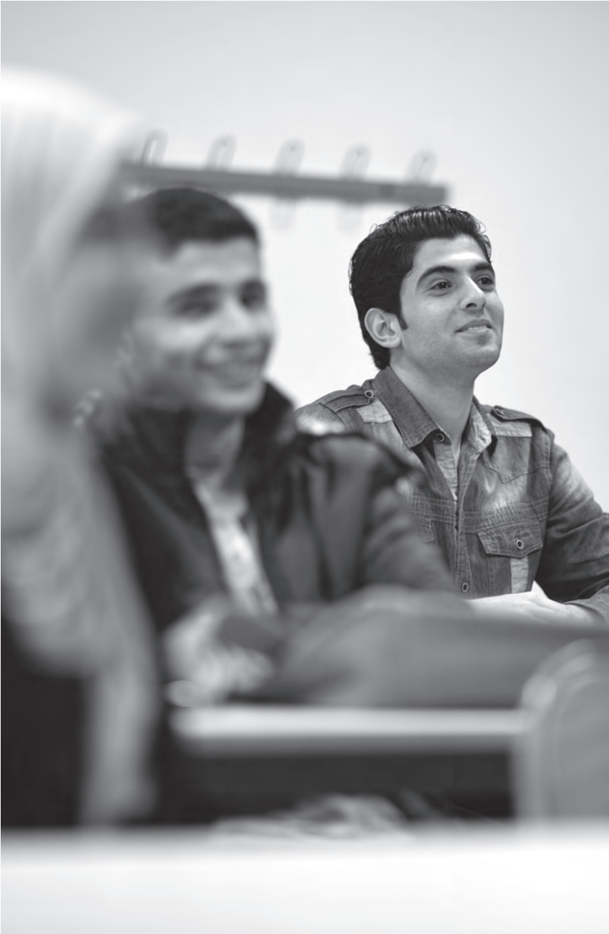
Young Syrian refugee students return to the classroom.