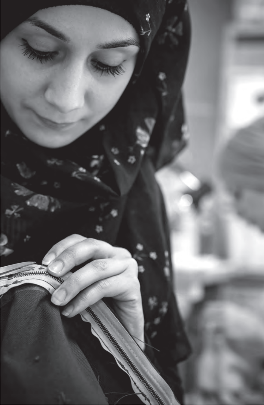
A young Syrian refugee taking part in a textiles workshop.