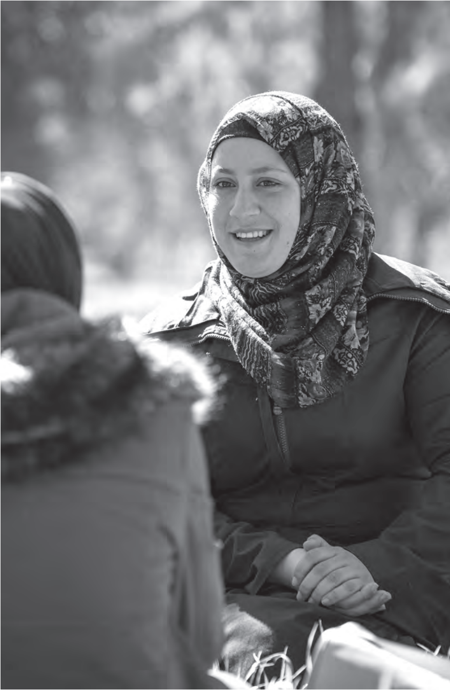
Syrian refugee studying at Al-Albayt University in Jordan