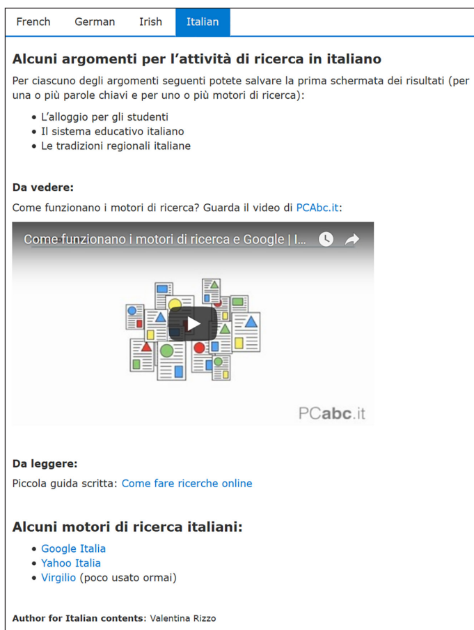
Figure 4. Localisation of Let's search! for Italian