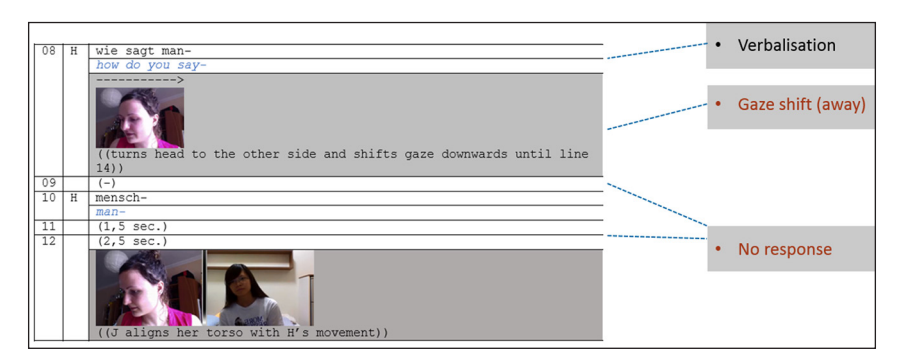
Figure 2. Extract 2

These conflicting cues lead to a very delayed response of J (Taiwanese tandem partner, Line 13), which is not taken up by H, but followed by a distinct pause (2 seconds) (Figure 3, Line 14). To clarify the argument being made here, it is important to note that H's gaze is still not focussed towards the interlocutor/the camera at that time. Only during the last 0.5 seconds of the pause in Line 14 does H re-focus her gaze and asks for repetition (Line 16). In Line 17, J responds again, which finally leads to a solution of the word search (not shown in Extract 3).