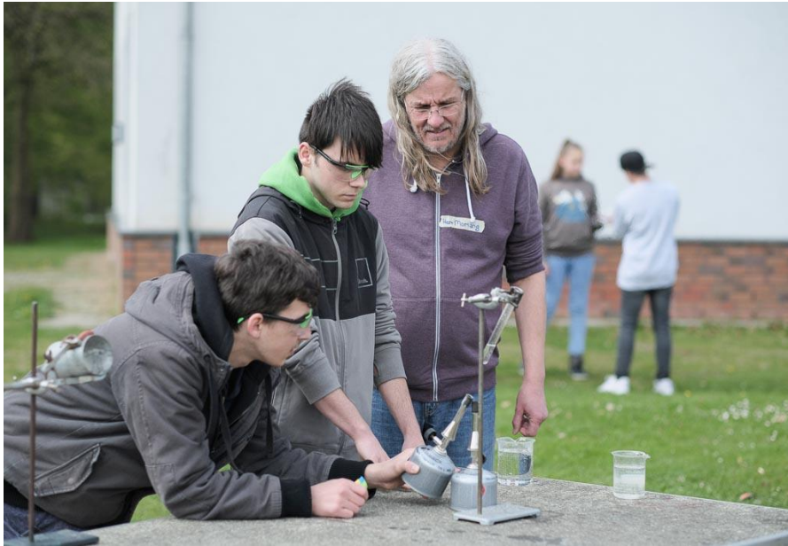
Students work collaboratively outdoors at Freiherr-vom-Stein-Schule Neumünster , a school in Germany designated as a Global Learning Network World-Leading Learner.

Building on findings and recommendations from the National Research Council 29 and their investments in a variety of school improvement efforts over several years, the William and Flora Hewlett Foundation argues that “students need a combination of cognitive, interpersonal, and intrapersonal competencies, and they must be able to use their knowledge and skills to solve novel problems.” 30