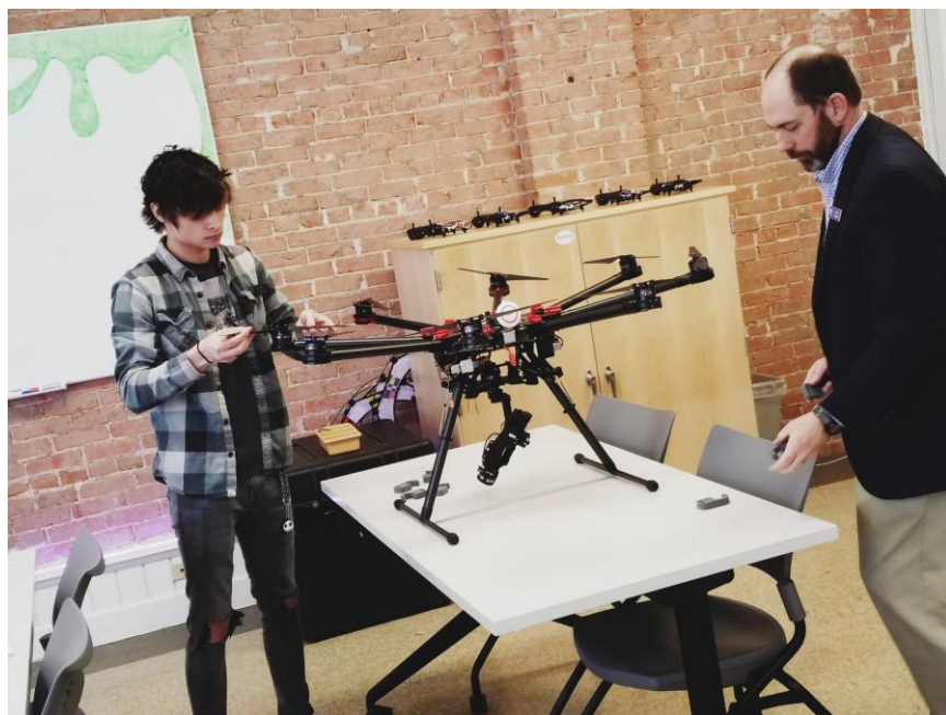
A student at Roscoe Collegiate High School , a Global Learning Network World-Leading Learner school, works on a drone.