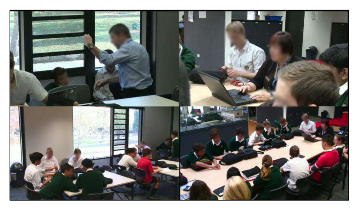
Figure 5: Organizational instruction at Central Park HS (at 16 minutes)

The following figures (Figures 5-8) show the snapshots of the types of activities that were coded using the system outlined above. The 'who', where' and 'what' were identified from these '4–ups', that show concurrent teacher practice in shared spaces.