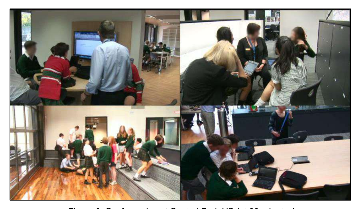
Figure 6. Conferencing at Central Park HS (at 33 minutes)