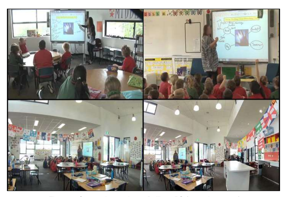
Figure 7. Content instruction at Balliang PS (at 6 min 40 sec.)