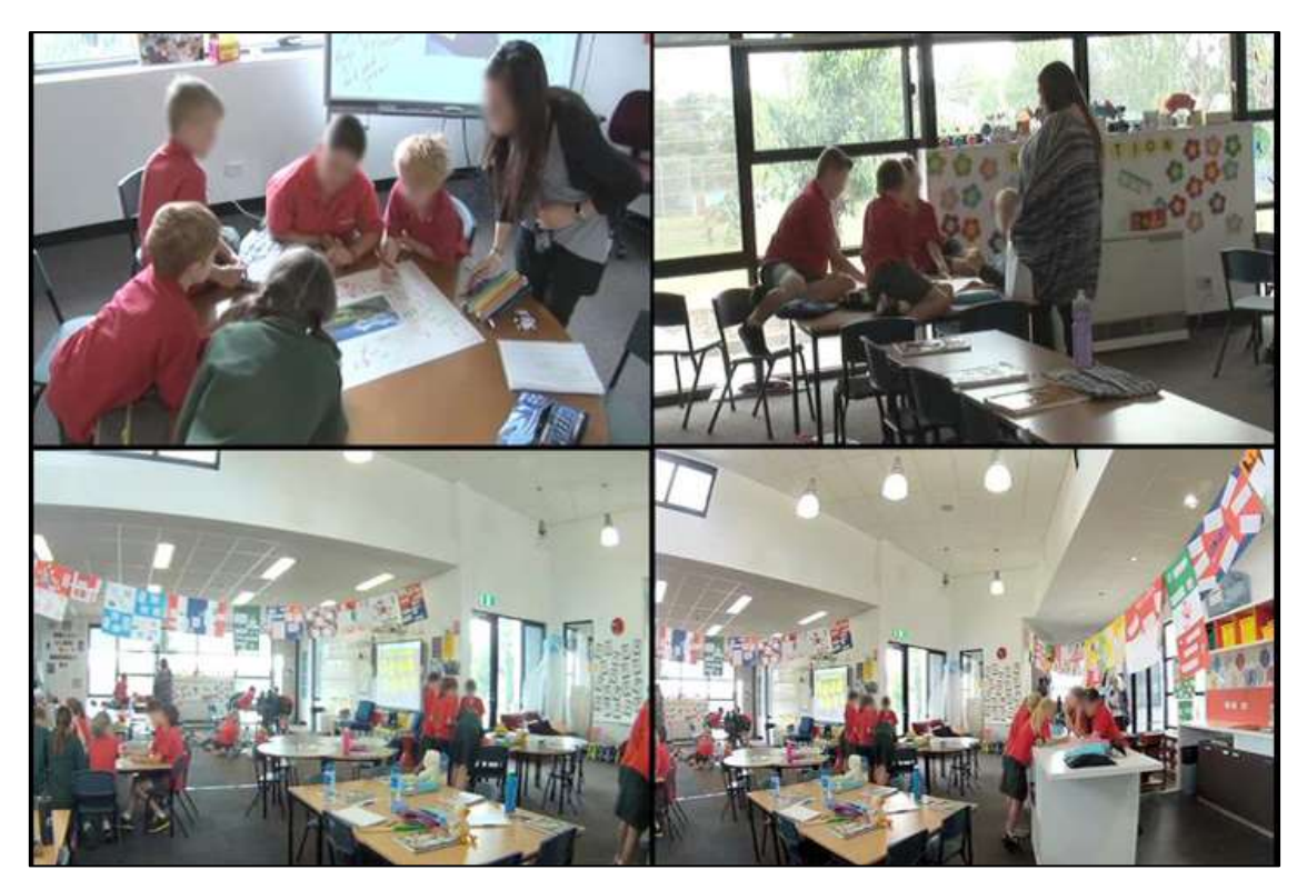
Figure 8. Conferencing at Balliang PS (at 25 min 45 sec)