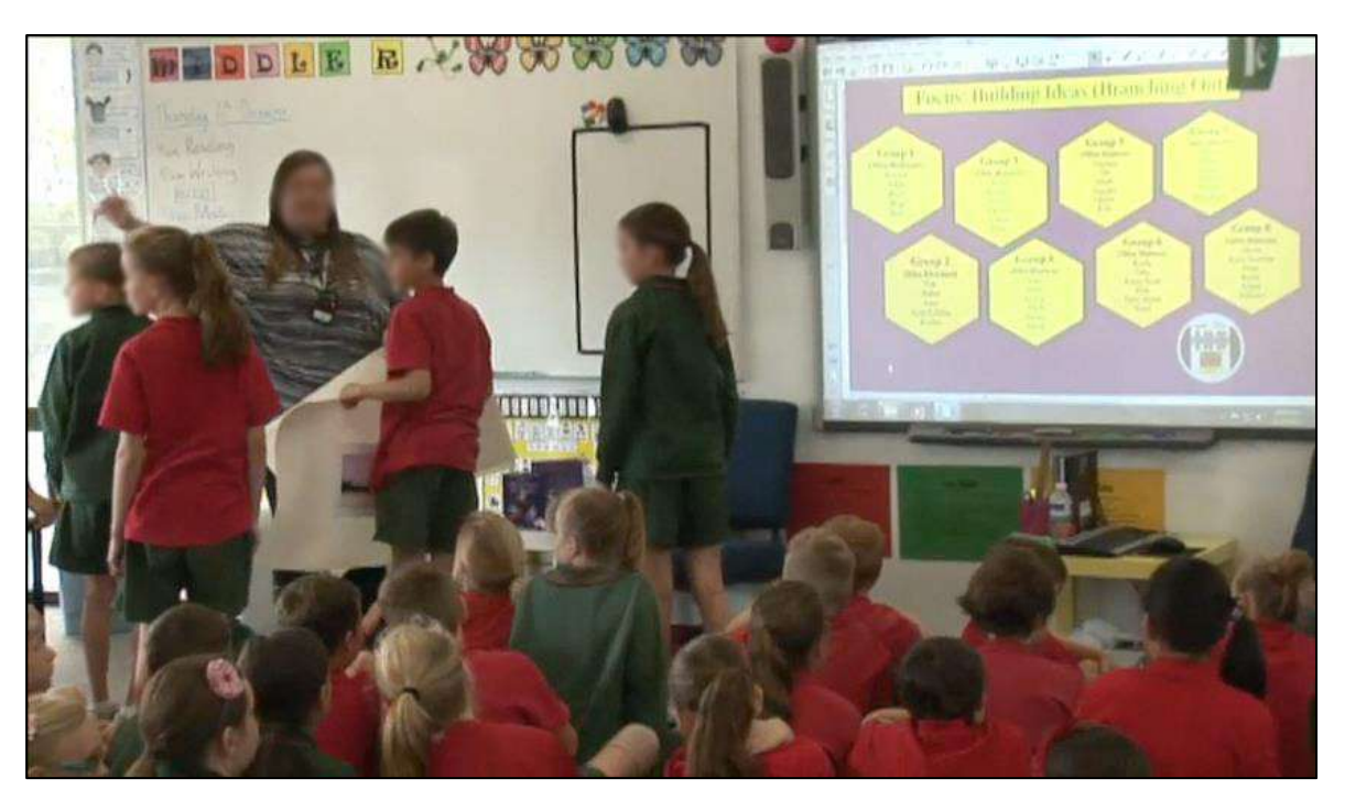
Figure 1: Teacher 1 at Balliang PS (at 11 min 45 sec)