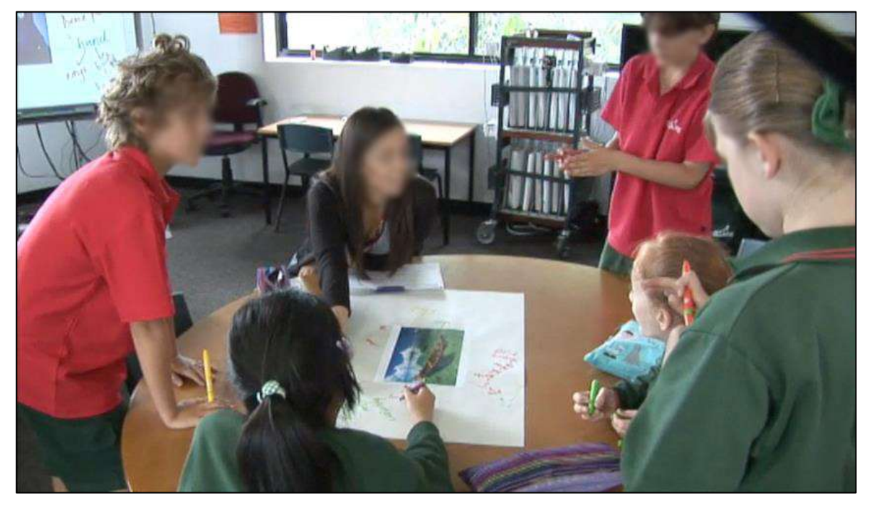
Figure 2: Teacher 2 at Balliang PS (at 14 min)