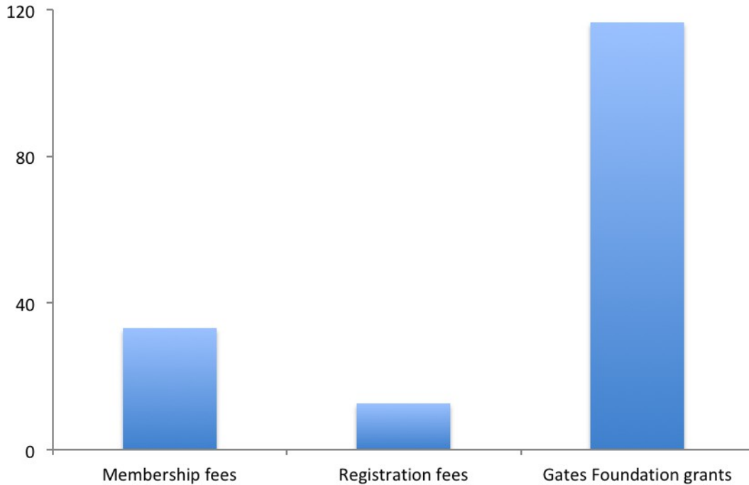
Figure 1. CCSSO Revenue from Membership and Registration Fees or Gates Foundation Grants in $millions, 2003–2017 11

CCSSO received over $2.5 million in member dues in tax year 2014. However, “contracts, grants, & sponsorships” income exceeded $31 million, twelve times the amount from dues and meetings. CCSSO in its current form could easily survive a loss of member dues payments; it could not survive intact the loss of its contracts and grants (currently, these are predominantly payments for promoting the Common Core). The tail wags the dog.