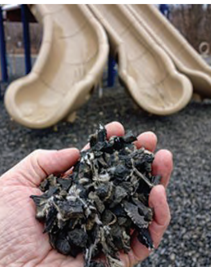
Crumb rubber can contain lead and other heavy metals.

Participants also agreed that a strong, unified communications campaign directed at diverse audiences will be necessary. A campaign will require targeting audiences, developing sophisticated messages, and employing a range of media, from public service announcements on radio and television to print ads to social media campaigns. Crafting clear, mainstream language that includes solutions-focused approaches will be critical, using the time-honored test of Will it play in Peoria? —that is, in everytown ? We also need to communicate with state and local funders so they can understand and support efforts to eliminate lead.