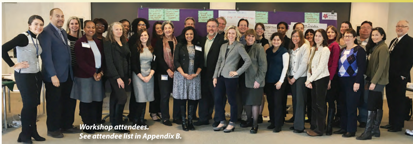
Workshop attendees. See attendee list in Appendix B.