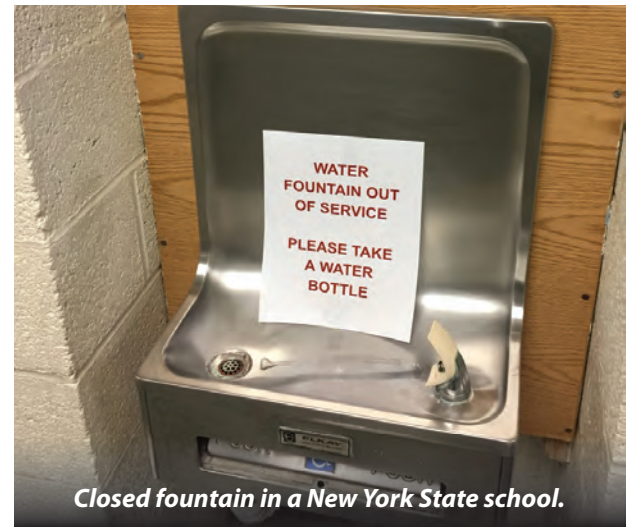
Closed fountain in a New York State school.

Removing lead from old buildings with old paint and from lead-containing pipes and fixtures can be costly for school and child care facilities, especially those serving low-income communities. Finding and using lead-free products and equipment, sometimes at comparable pricing, is likely to be simpler. Workshop participants noted a range of investment options for eliminating lead, as well as the need to seek broad bipartisan support for funding public agencies.