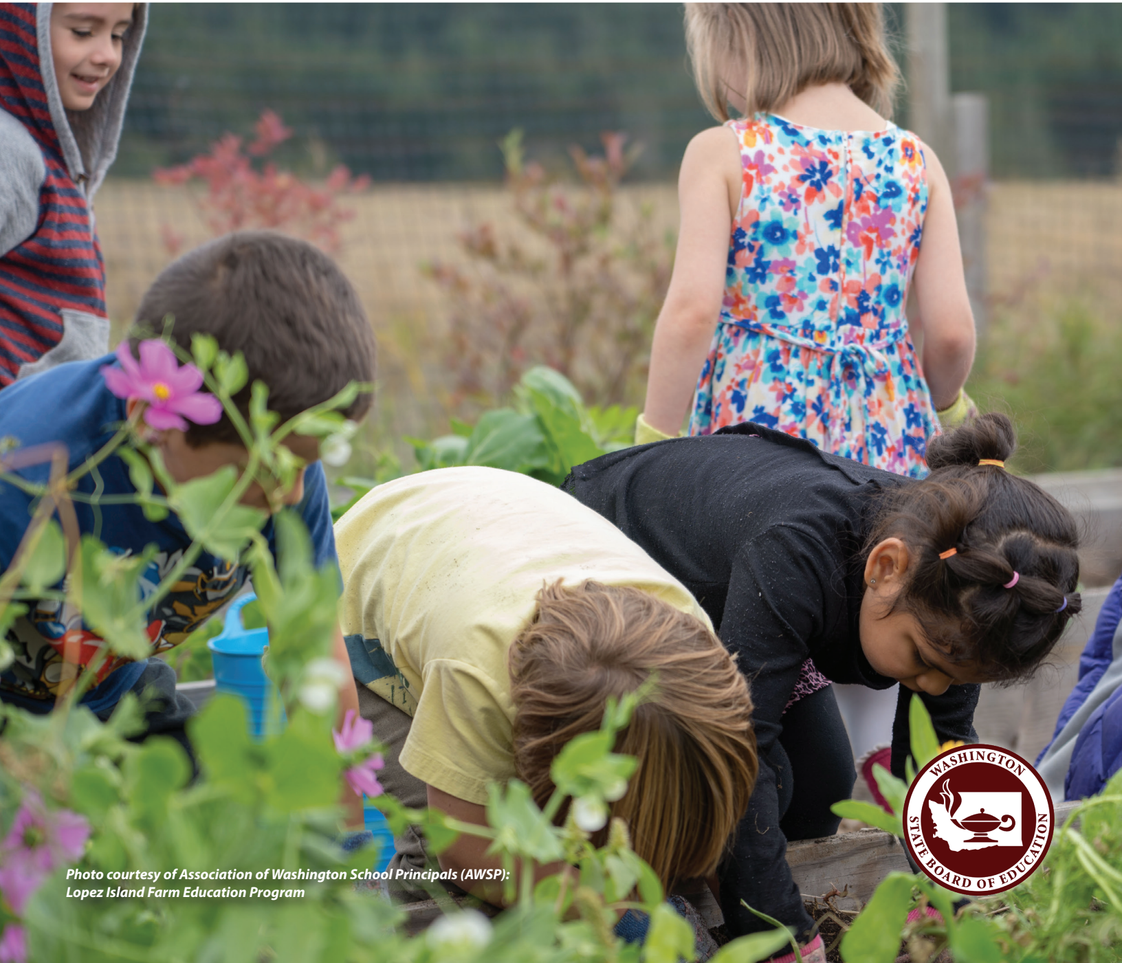
Photo courtesy of Association of Washington School Principals (AWSP): Lopez Island Farm Education Program