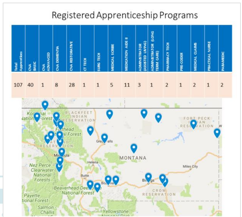
HealthCARE Montana Website, September 2017